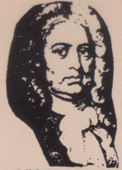
GEORGE FRIDERIC HANDEL

"HANDEL WAS A MASTER OF MUSIC IN ALL ITS FORMS."