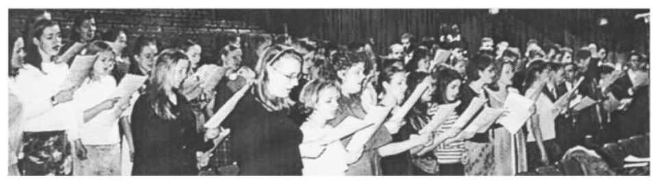
BYU 21st Stake Choir warming up