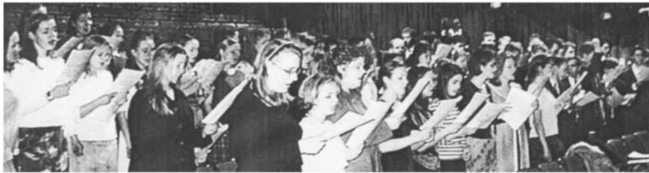
BYU 21 st Stake Choir warming up