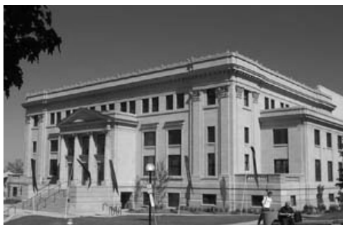
David P. Gardner Hall, University of Utah