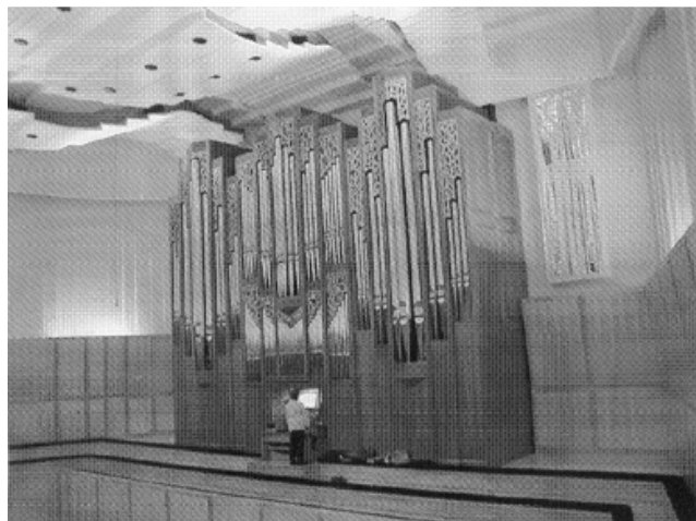
View of the Lively-Fulcher Organ