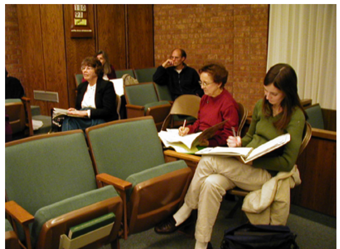
The rest of us taking notes