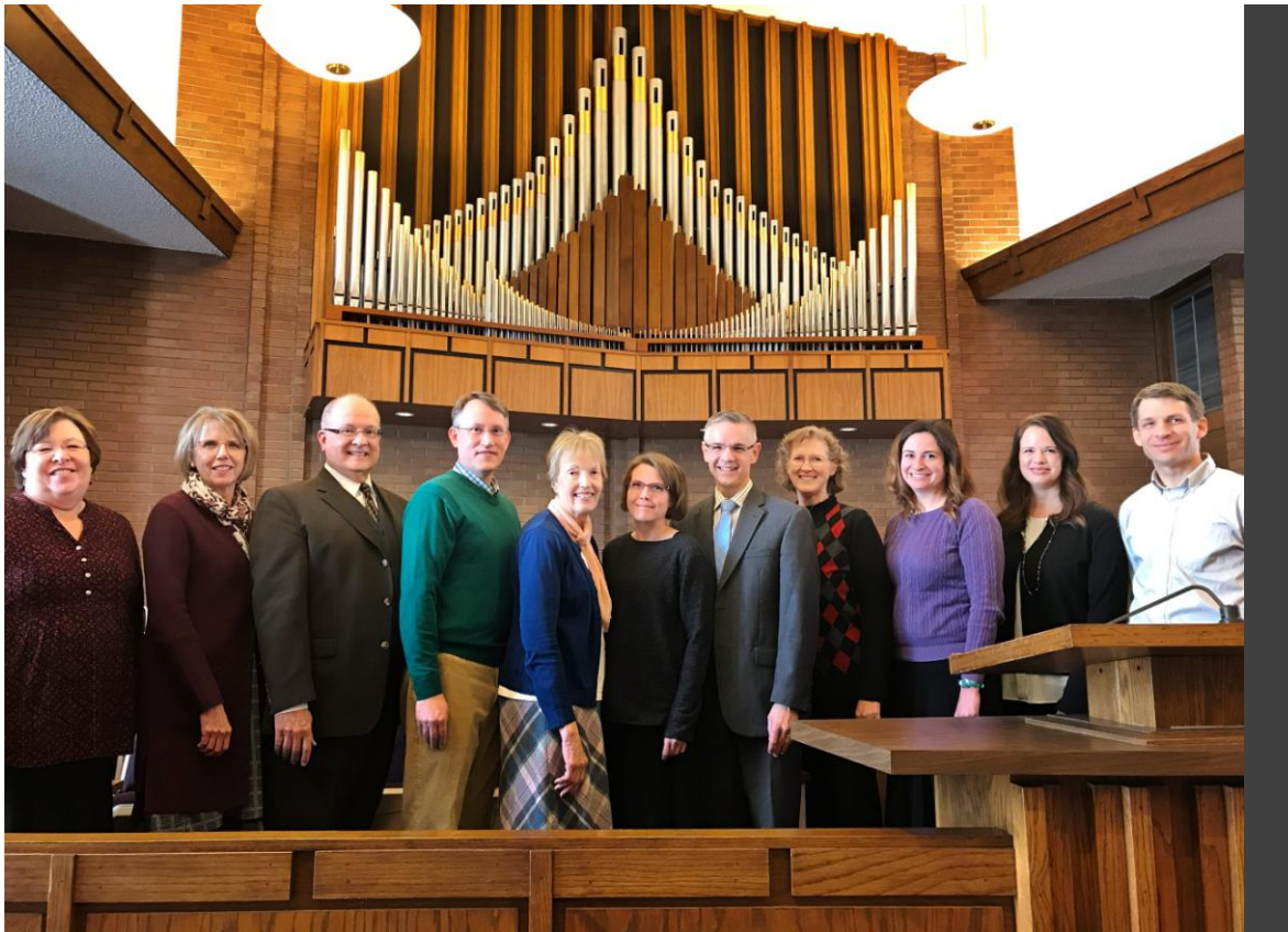
January 19, 2019: Performers in the Utah Valley American Guild of Organists Chapter Recital in Spanish Fork, Utah.